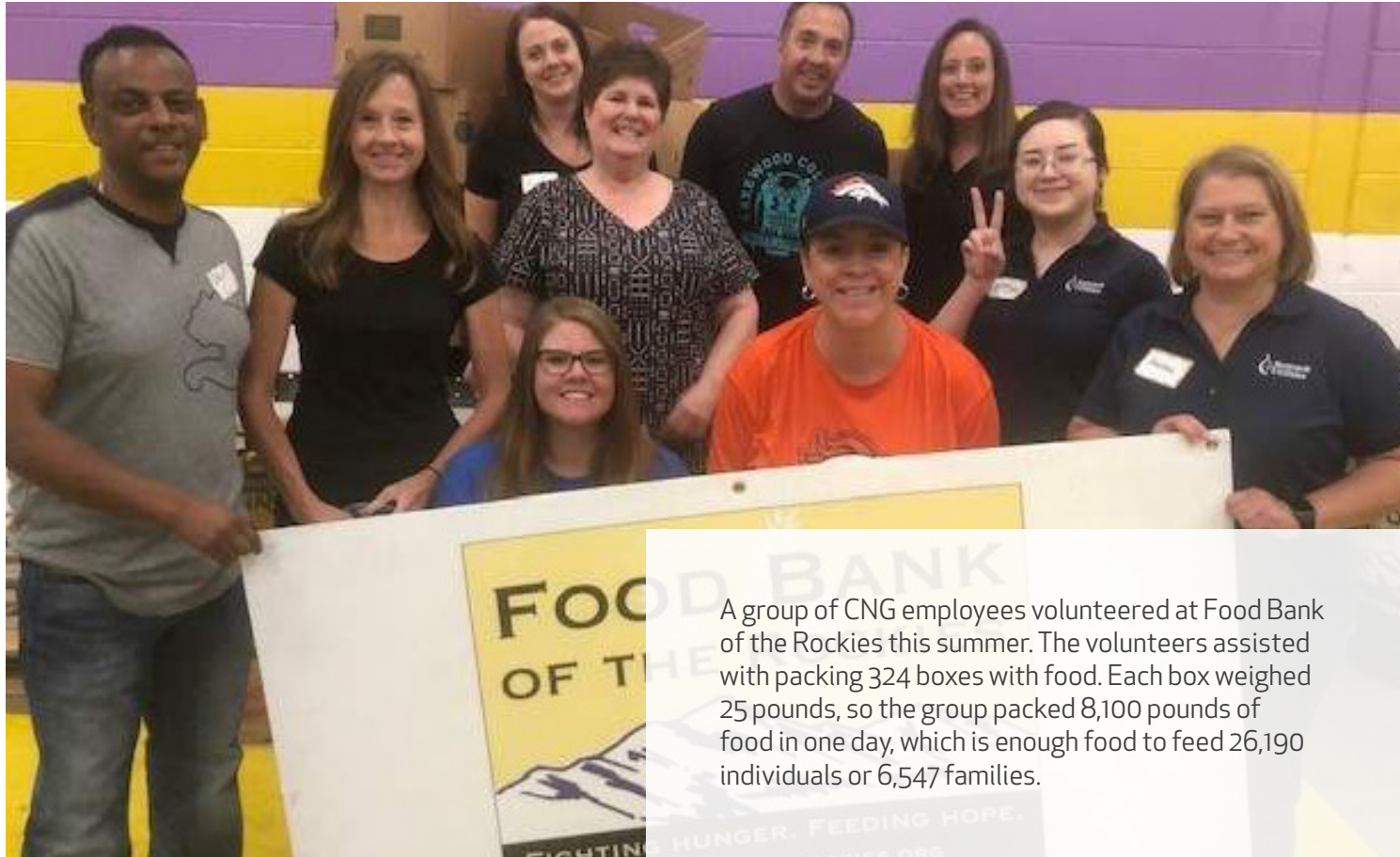
A group of CNG employees volunteered at Food Bank of the Rockies this summer. The volunteers assisted with packing 324 boxes with food. Each box weighed 25 pounds, so the group packed 8,100 pounds of food in one day, which is enough food to feed 26,190 individuals or 6,547 families.